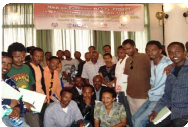
Trained high school teachers from six target schools posing for a camera

“ I used to believe that my mother and my sisters were solely responsible for carrying out all household activities, including washing my clothes. After getting involved in MAP peer discussions, I realized that I was wrong. Thanks to MAP project now I’m very proud and happy in sharing equal responsibility in undertaking household activities”.