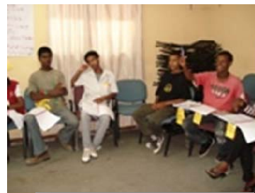
Youth attending Men As Partners ® (MAP) Project In-school Intervention Class Monitor Training organized by Hiwot Ethiopia and Engender Health

Engender Health in partnership with Hiwot Ethiopia found that a total of 84 youths or 42% of discussion participants have tested voluntarily as result of their involvement in MAP, according to reports collected from youth clubs. This is a clear indicator of how addressing male gender norms increases knowledge, improve attitudes and practices of vulnerable youths, and consequently contribute to HIV prevention. It is expected that the awareness created by addressing harmful male gender norms will help beneficiaries to develop safer sexual practices and behaviors.