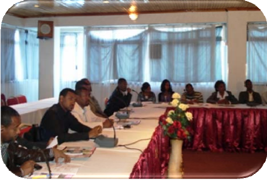
ለባለድርሻ አካላት የተዘጋጀ የማጥ ፕሮጀክት ማስተዋወቂያ ወርክሾፕ